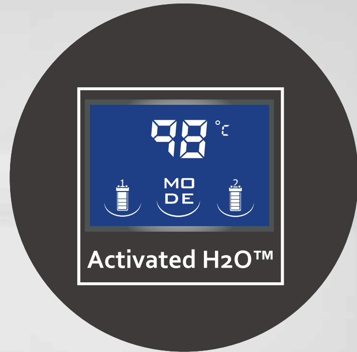
Temp and filter status indicator

Activated H 2 O™ presents its uniqueness and the aesthetics of living while providing your customized needs.