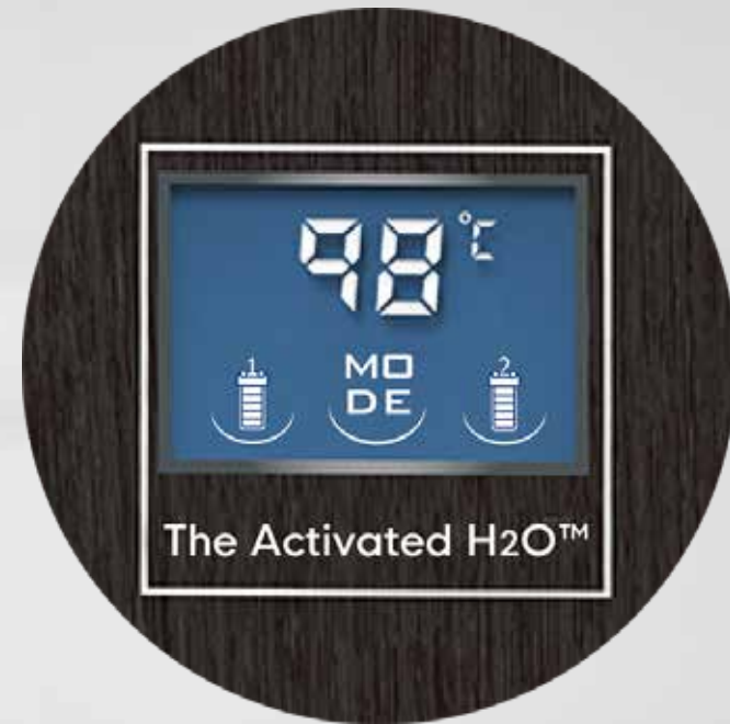
Temperature and Status Display

The Activated H 2 O™ presents its uniqueness and the aesthetics of living while providing your customized needs.